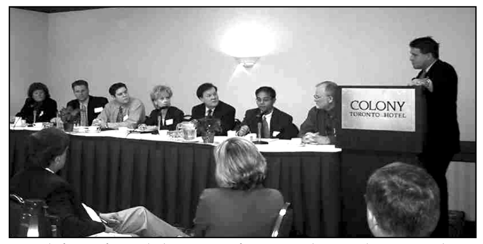
A panel of HR professionals shares great information with Toronto/SW Ontario Chapter members at a December 2001 sell-out meeting.

Toronto/SW Ontario Chapter held an excellent program in December of 2001